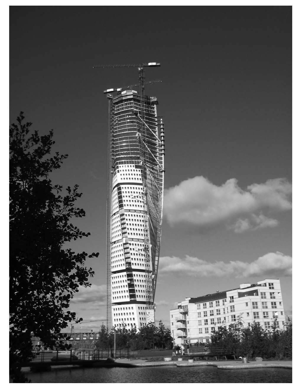
Figure 1 'Turning Torso', October 2004